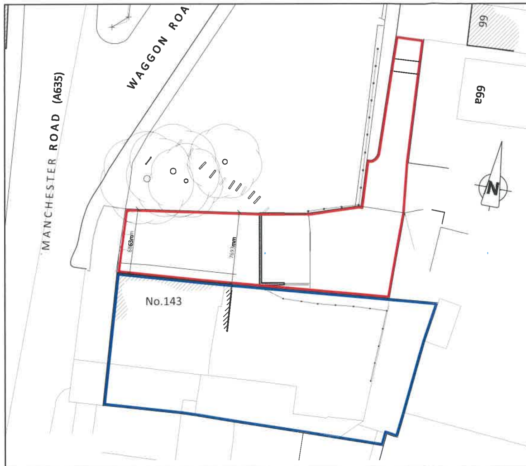
Lease Area Extents (Scale 1:250)